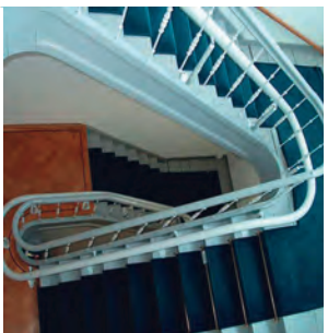
Vermeer Multiple floors

The rail system is the same regardless of which side of the stairs it is situated, or if it travels over multiple floors only the model name will change.